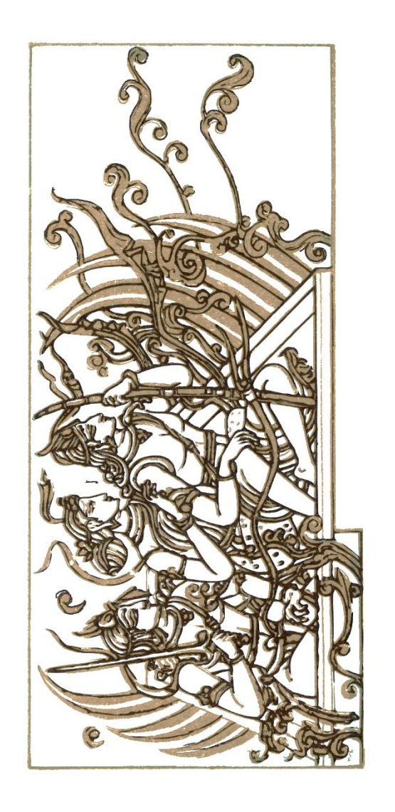
Lord Rama, Mata Sita and Laxman depicted in Chapter III of the original handwritten Constitution of India