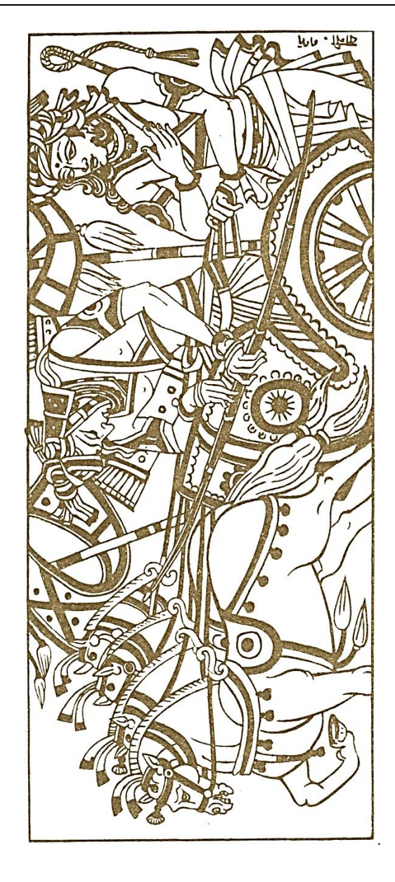
Lord Krishna and Arjuna depicted in Chapter IV of the original handwritten Constitution of India